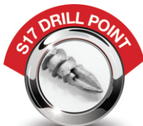
TIMTAPP® Timber application