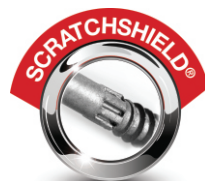
SCRATCHSHIELD® For Crest Fixing Fastener