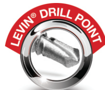
METAPP® Steel Application

Here are some of our patented innovations to reduce work time, increase productivity, workmanship and deliver quality results.