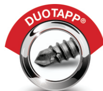
DUOTAPP® Steel & Timber Application